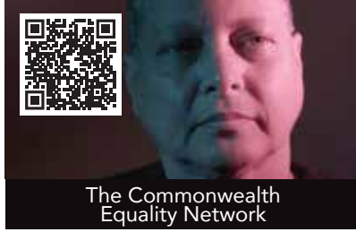
The Commonwealth Equality Network