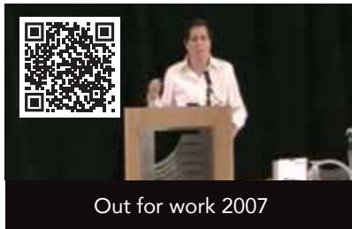
Out for work 2007