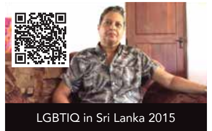
LGBTIQ in Sri Lanka 2015