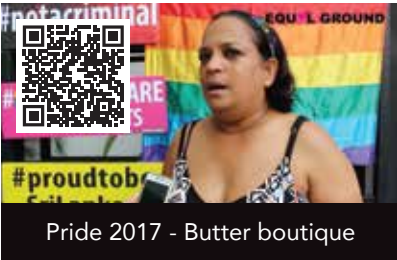
Pride 2017 - Butter boutique