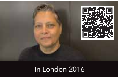
In London 2016