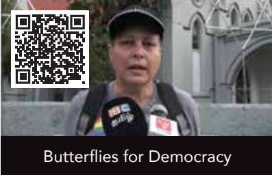
Butterflies for Democracy

எங்களுடைய ஆலோசனை மற்றும் பிரச்சாரங்களை சற்று பார்வையிடவும்! කරුණාකර අපගේ ප්‍රචාරයන් සහ ප්‍රයත්නයන් දෙස බලන්න!