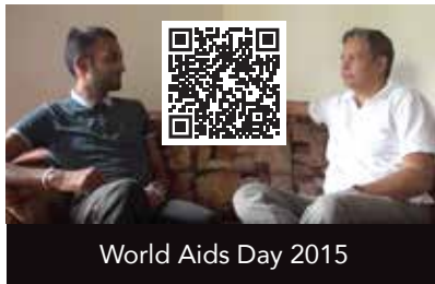
World Aids Day 2015