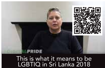
This is what it means to be LGBTIQ in Sri Lanka 2018