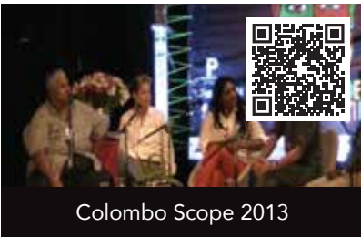
Colombo Scope 2013