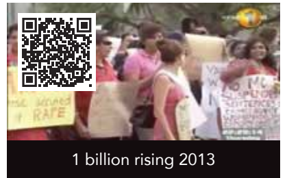
1 billion rising 2013